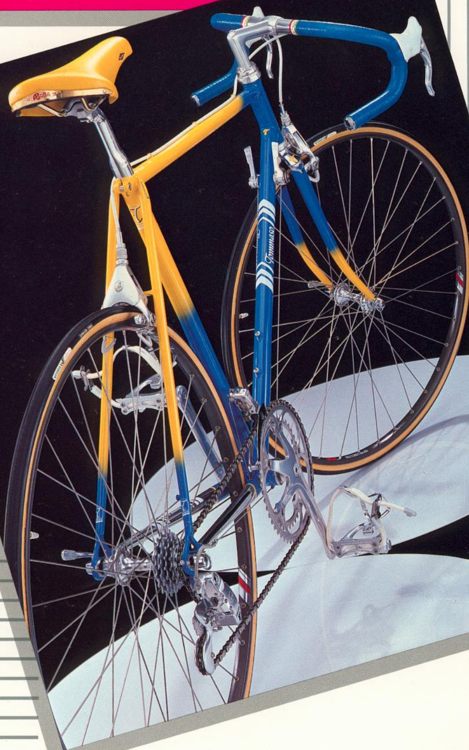
TLX/SLX Comparative Frame Specifications