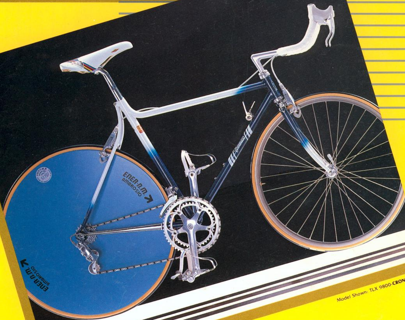
Model Shown: TLX 9800-CRONO