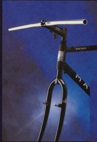
MARIN LITE HANDLE BAR, STEM AND FORK

For '92 we have made our super light weight components available separately. Now everyone can benefit from the weight savings that these high quality, durable parts offer.