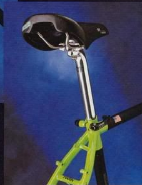
MARIN LITE SADDLE, SEATPOST AND Q.R.