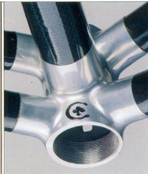
In the insert we can see not only the central gearbox, but also the frame, without fork, in which the accuracy of the details and the oblique section obtained with two twinned tubes should be noted. On the opposite page, the perfect geometry of the complete structure with the special aluminium alloy fork.

tubes of differing diameters) and with the intention of devising a bicycle frame, a designer worthy of the name must endeavour to select tube in which diameter and thickness will be limited. This enables him to enhance the qualities proper to steel, which are strength and toughness. Hence a sufficiently strong and rigid frame, with relatively small dimensions for the sections used.